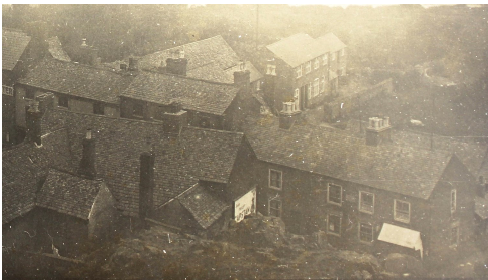
9. A jumble of rooftops but where are they?