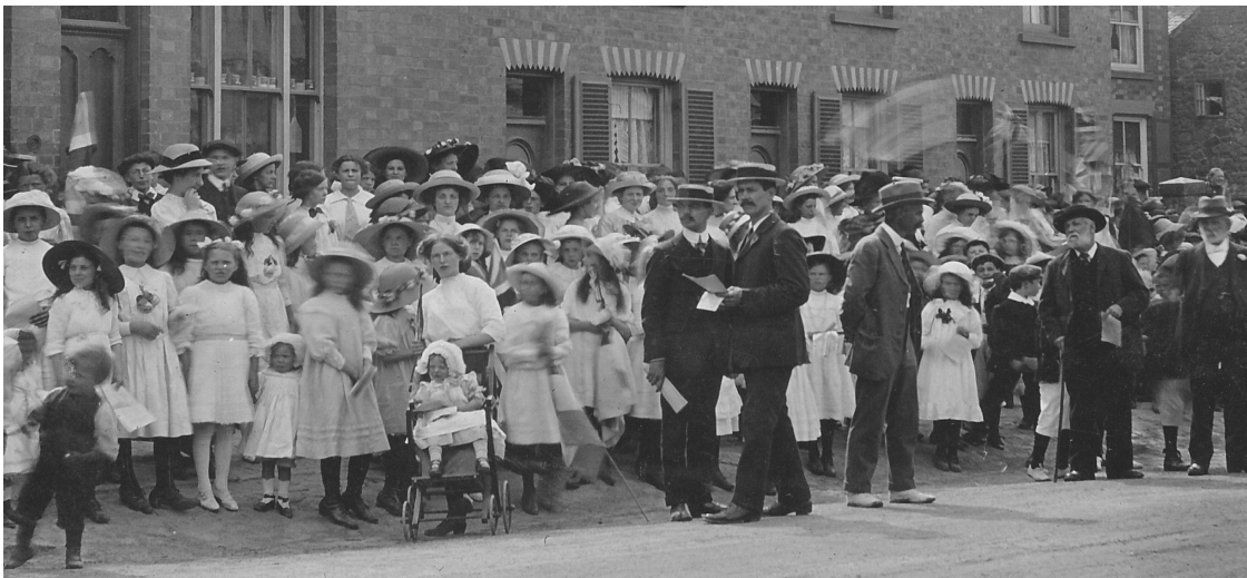
13. A lot of people, but where?