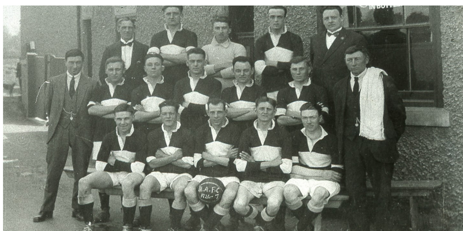
11. Footballers 1926/27 season outside ?