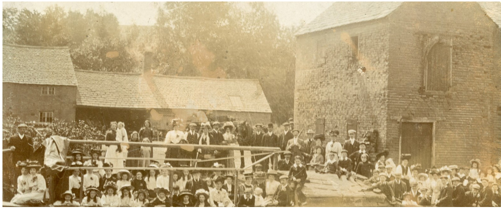
12. A lot of people, but where?