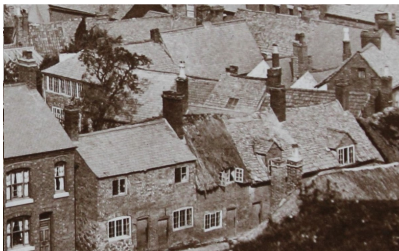
10. A jumble of rooftops but where are they?