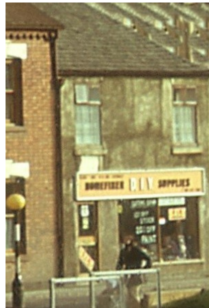
7. After Stirling work this building certainly did not sink like a lepidoptera and neither does it inflict pain Bombus style but what is it?