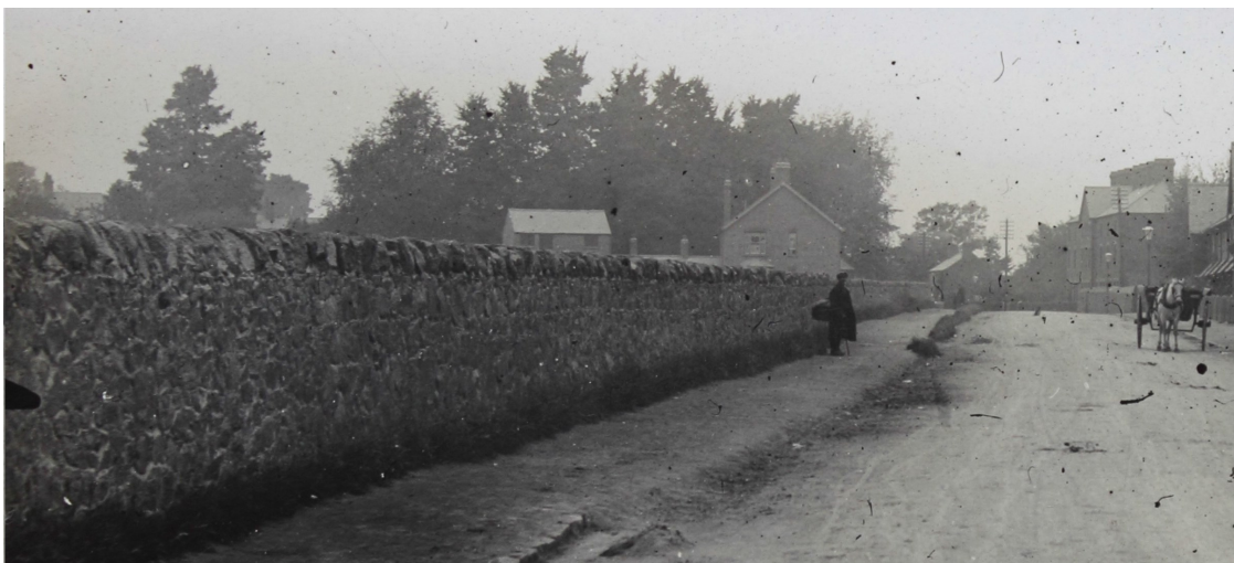
14. A solitary person but where?