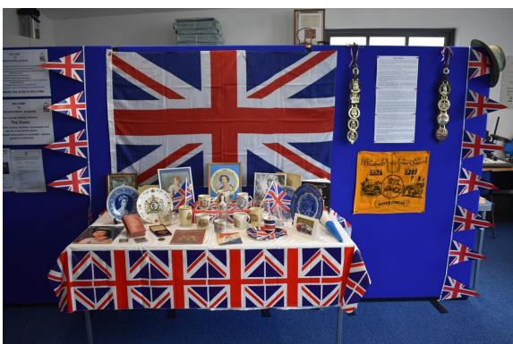
Jubilee Artefacts display in the village museum.