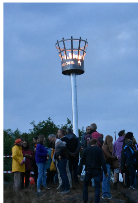
The new beacon on Castle Hill and Fireworks on Jubilee Night.