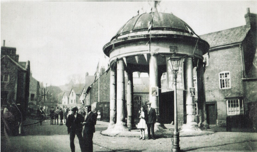
King George V's Silver Jubilee 2nd May 1935 The Buttermarket and Watling St.