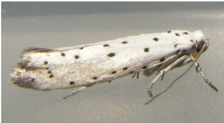
Willow Ermine Moth