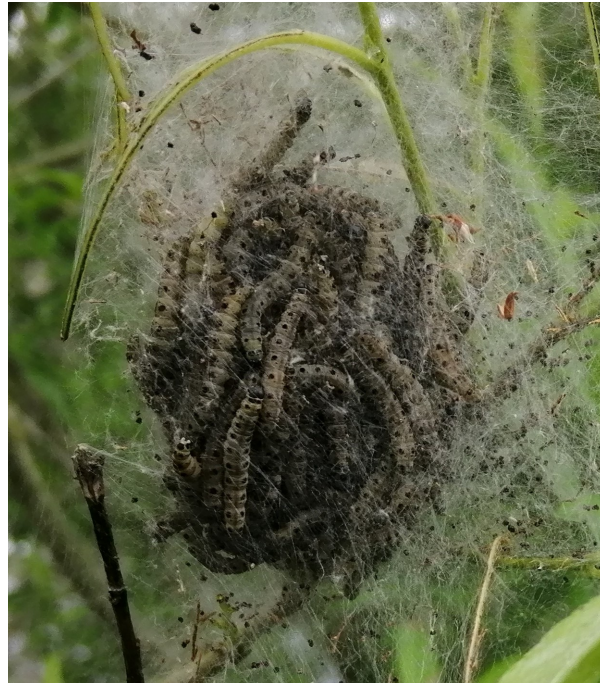
Willow Ermine Moth webs and Caterpillars at Cossington Meadows