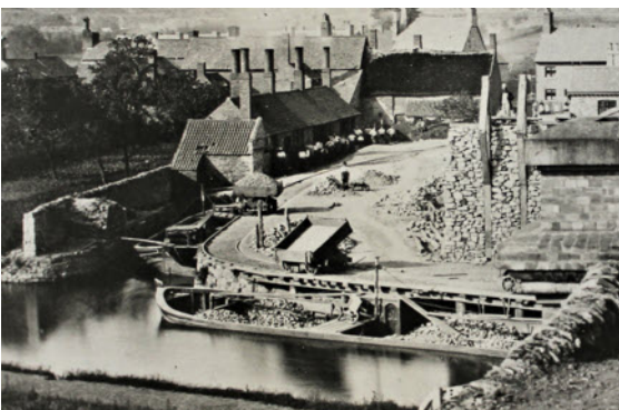
Loading by tipping trucks

To obviate this a vast V-shaped hopper was constructed, with iron shutters at the bottom. The hopper was filled with truck loads of stone and a barge moored under the shoot. It was then filled in just a few minutes by opening the iron doors.