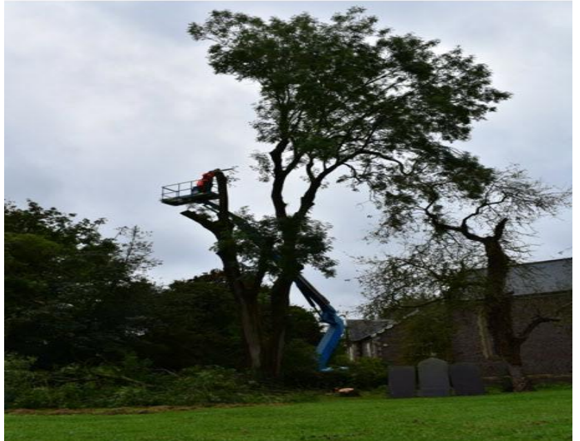
25 September - working in the rain