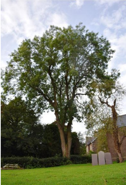
August 2019 - prior to surgery

During the last week of September 2019 tree surgeons severely lopped the large Ash tree which stands by the Bower Room Drive. The tree is estimated to be 150 years old but this last 12 months it has been losing large boughs which have been a real hazard to passers-by. On investigation it was found to be infected with bracket fungus and hence therefore required surgery. The main trunk has been left to re-sprout.