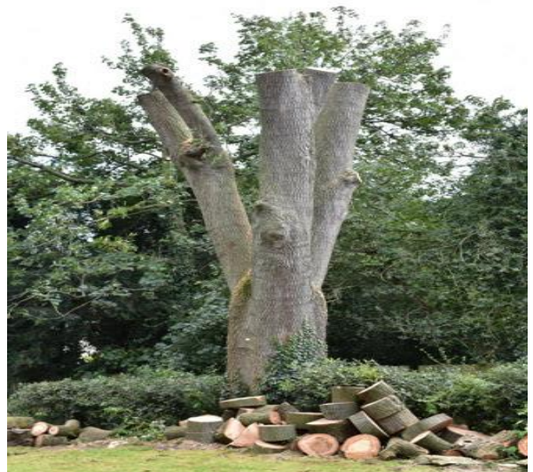
26 September - the finished job