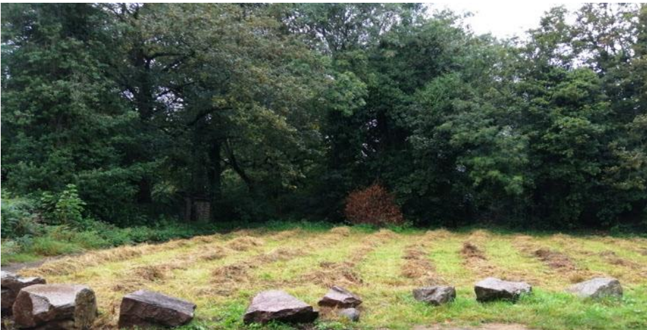
24 September 2019 - Awaiting clearance in the rain