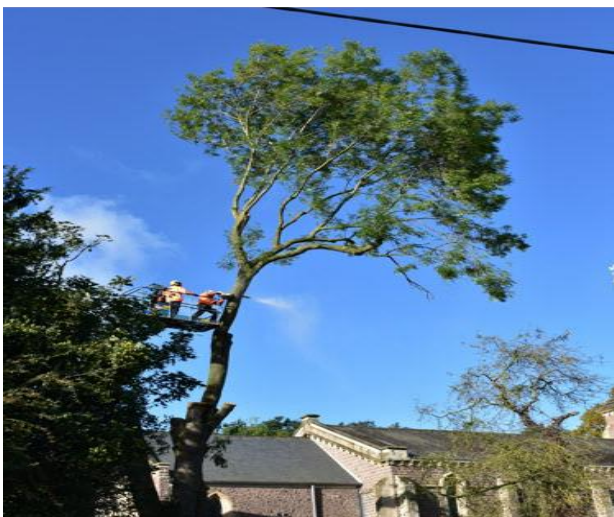
26 September - the final bough being cut