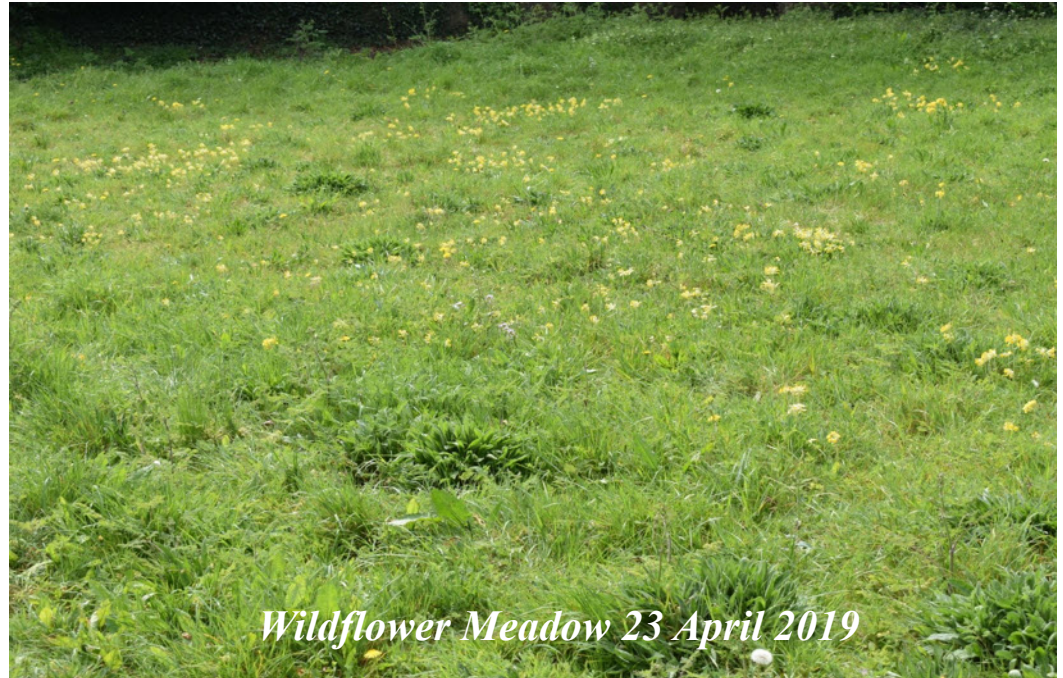
Wildflower Meadow 23 April 2019

Despite our gloomy prognostication last month we did in the end get at least half a dozen of the Snake's-Head Fritillaries in flower and as they went over to seed we've had our best show of mixed Cowslips and Oxlips to date.