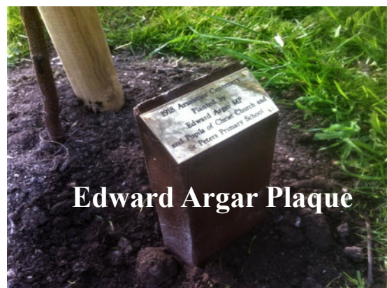
Edward Argar Plaque

The second was to plant the Pyracantha funded by a Borough Councillor's Grant to the Mountsorrel Branch Royal British Legion. We planted 26 pyracantha along the Sibley lane wall and plan to trim these to a low wildlife friendly hedge which will have the added bonus of red berries for the autumn and early winter. The next work party day at the Peace Garden is planned for the morning of Wednesday 15 th May. If you can help do come along you'll be very welcome. We plan to be weeding, edging and generally tidying up so simply bring your gardening tools and a smile!