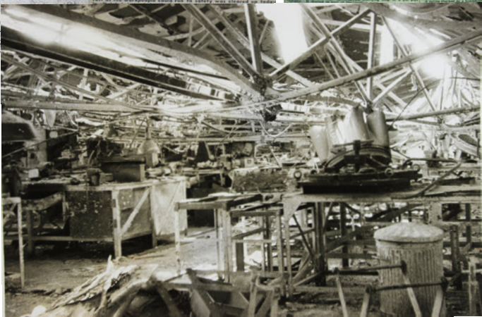
After the fire 1959