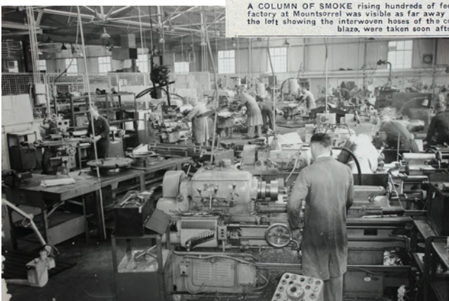
Tool Room 1945