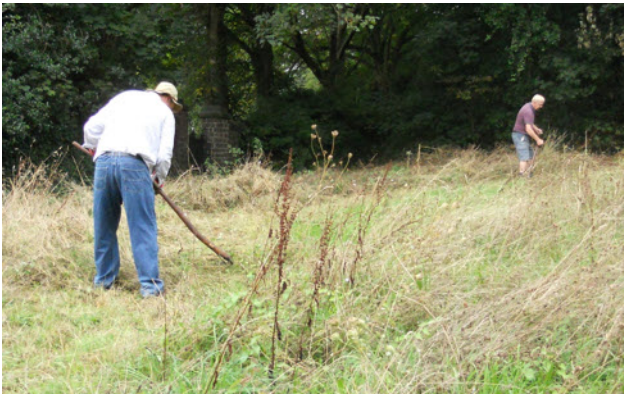
Scything in progress 3 rd September 2018

Scything is now complete and the meadow is ready for winter. It will be interesting to see what effect this year's unusually long hot and dry spell will have had on next year's flowering.