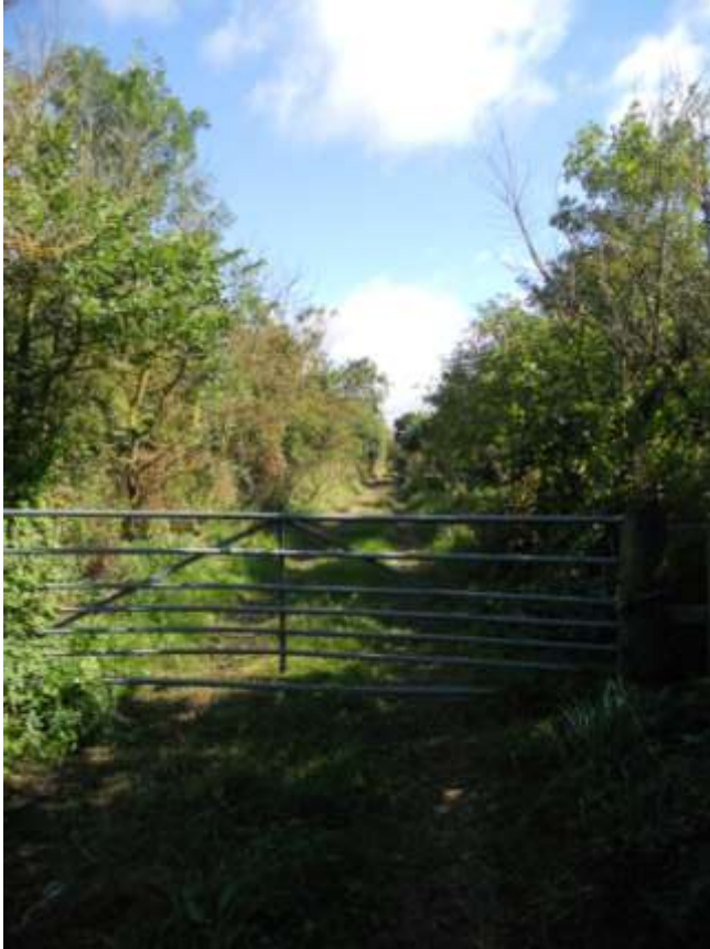
Barrow Horseshoe - Betty Henser's Lane north of the A6 Bypass