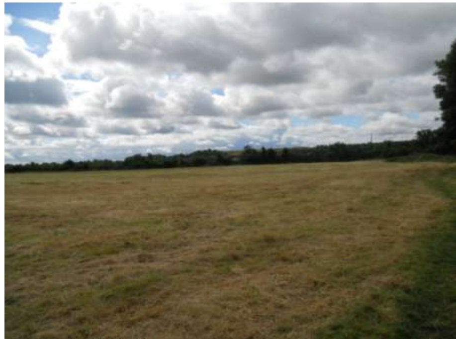
Betty Henser's Lane Fields looking towards the village

Used essentially for grazing, there is still evidence of rig and furrow but the area has been widely affected by the building of the A6 Bypass and Granite Way. There remains though, good footpath access and in summer Swallows, Sand and House Martins feed off airborne insects.