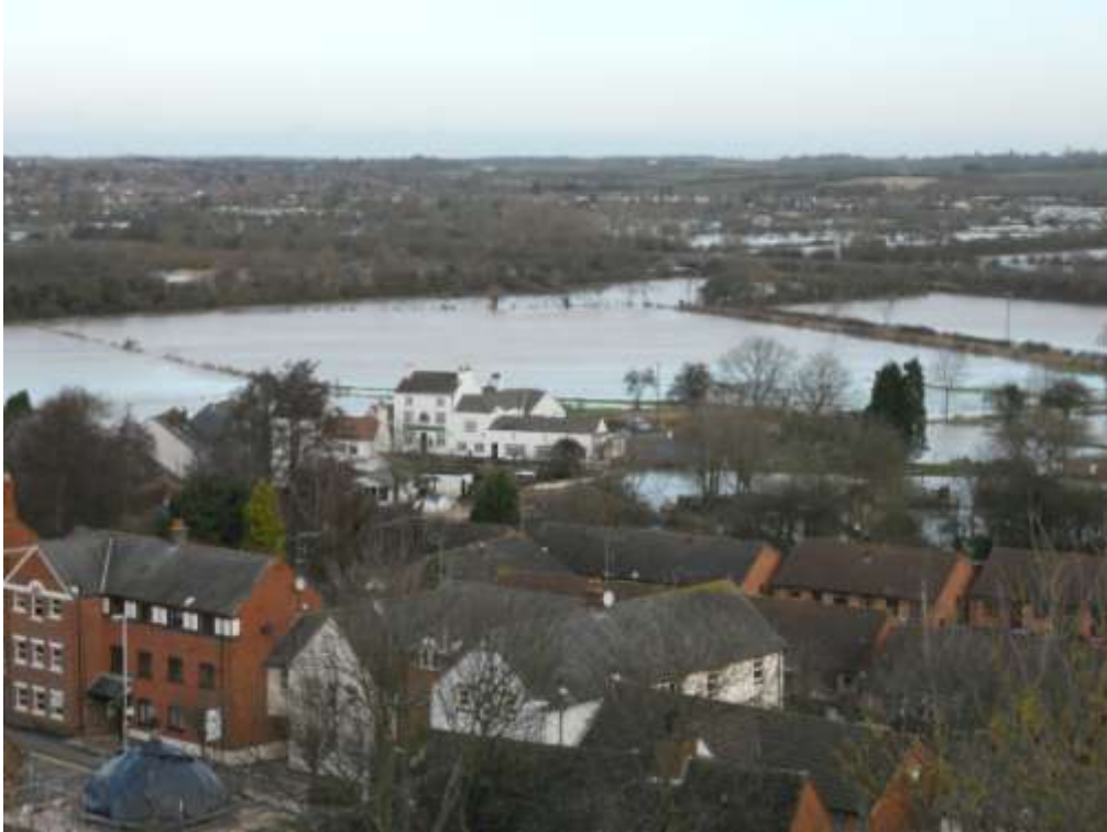
River Soar in flood – December 2012