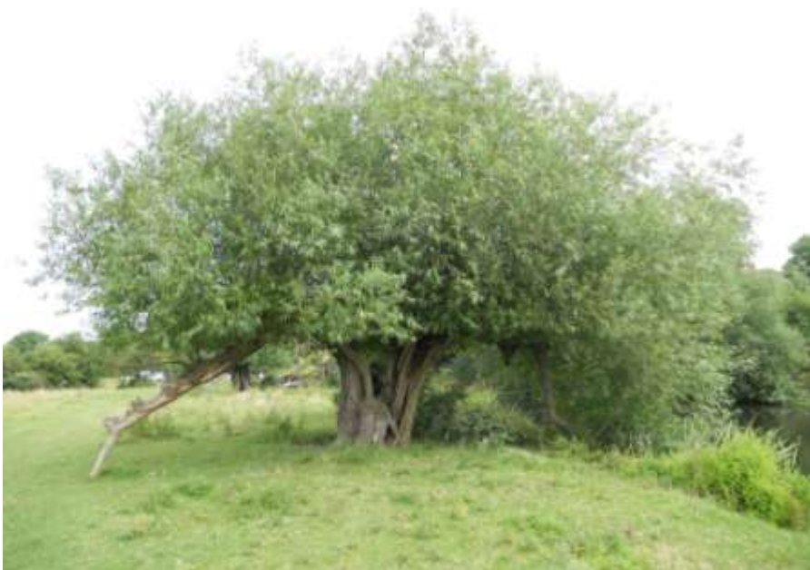
Willow alongside the Barrow horseshoe footpath June 2016

Privately owned but with good footpath around the whole river edge. Some interesting backwaters, trees and remains of extensive rigg and furrow in the fields. CBC have a triangular shaped field adjacent to the weir before Barrow Lock listed as a candidate SiNC under reference CBC W 5716 / 8. The field was surveyed in 2004 and 2005.