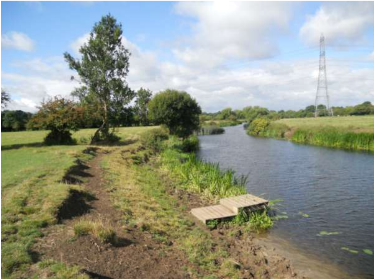
Riverside footpath looking downstream at the Quorn boundary with The Bones

These fields are used for grazing and for the Quorn Car Boot held at Freeway Farm. As with Betty Henser's Lane fields these have been widely affected by the building of the A6 Bypass and Granite Way. The riverside and hedgerows support a wide range of passing birdlife throughout the year.