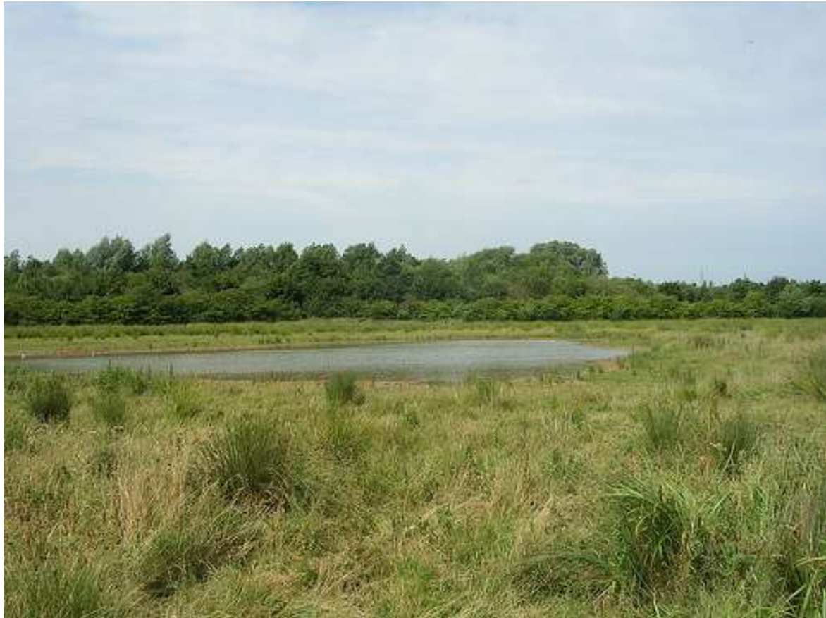
Mountsorrel Meadows – wet scrape May 2011

The whole site is closely linked to the L&RWT Cossington Meadows Reserve which is now of national importance.