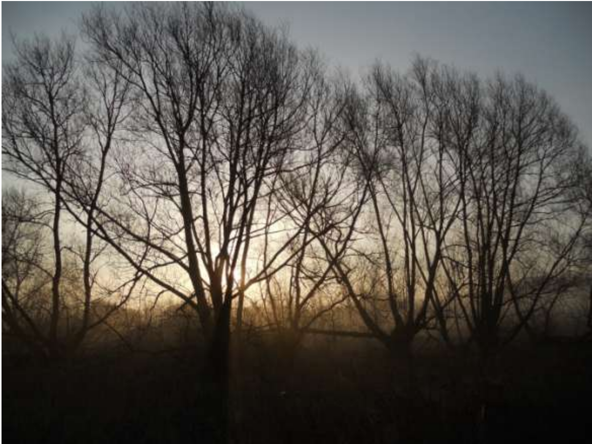
Mountsorrel Meadows central copse at first light - March 2009

A mix of planting and natural regeneration has allowed the creation of areas of wet woodland. In the main woodland area planting with alder trees and willow sticks (sections of cut willow stems which when pushed into the ground develop roots and grow) has taken place. Other, smaller areas of woodland have developed entirely on their own from seeds which have blown in or washed in by floodwaters.