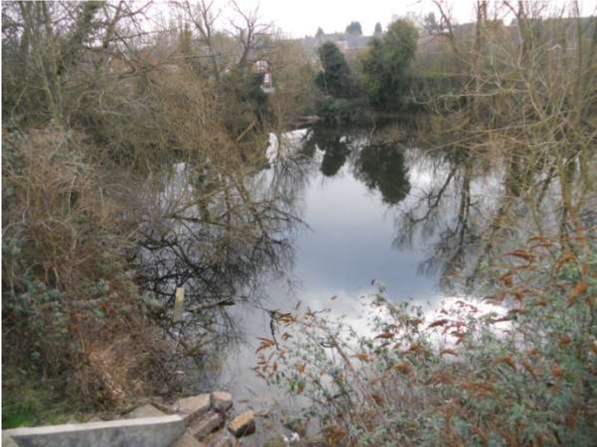
Linkfield Rd Pond from McQueen Drive - 2016

The pond is in private ownership and is not accessible to the public, being securely fenced for obvious health and safety reasons. Whilst the perimeter is quite heavily wooded limited visibility is possible from McQueen Drive (off Linkfield Road).