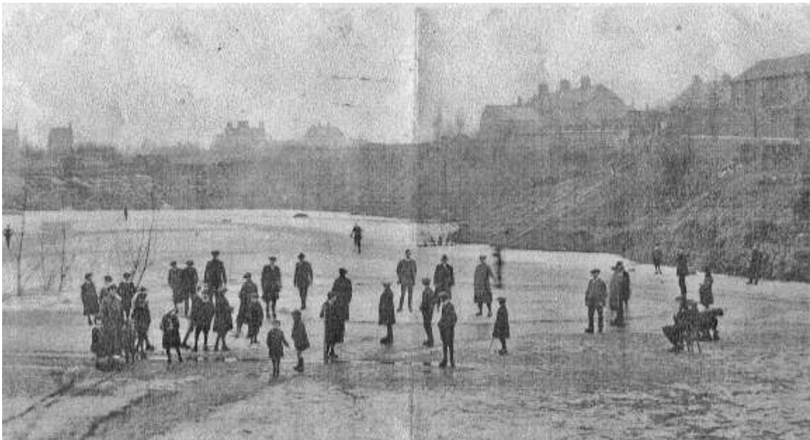
Villagers skating on the brickyard pond – late Victorian era

Linkfield Road Pond is part of the former clay pit of the Victorian Adkins Brickworks, later part of the Alvis/Rolls Royce and Cardboard Box manufacturing sites now redeveloped for housing.